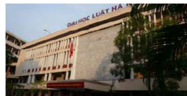
Research and Education Center for Japanese Law