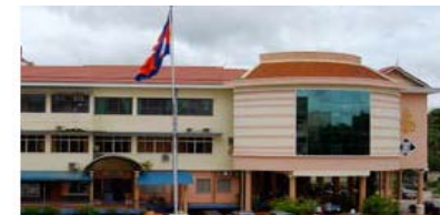
Research and Education Center for Japanese Law