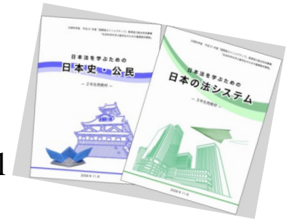
Textbook used in Research and Education Center for Japanese Law