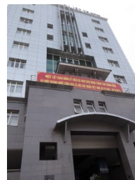
Research and Education Center for Japanese Law